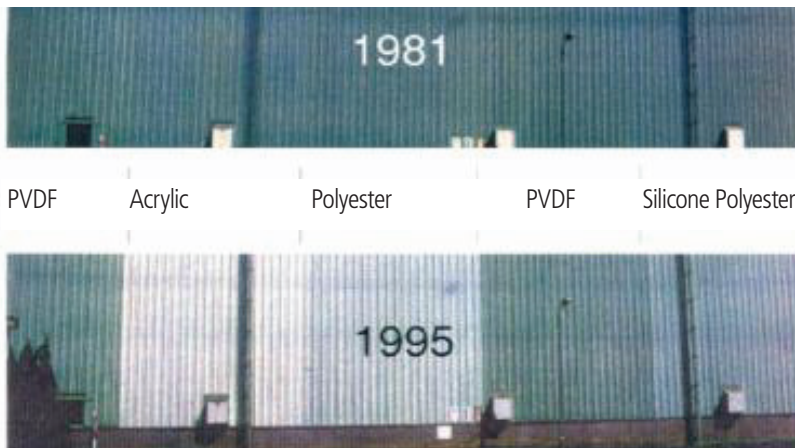
PVDF Acrylic Polyester PVDF Silicone Polyester

The right combination of resins and pigments is essential to coating performance to ensure protection against chalk and fade. No matter how well a coating is made, certain colors are more affected by the outside environment than others, especially bright colors like yellows, oranges, and reds. When selecting a color, take into consideration UV exposure and end-use. Color is also a determinant of warranty length. Color warranties are based on the percentage of organic versus inorganic pigments used to create the final color.