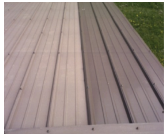
Silicone Polyester Fluropolymer

Fading occurs when substances in the environment attack the pigment of the paint and cause the color to change. Fade is caused by a breakdown of the pigment itself, measured in Delta E (DE) variations. Color fade in the paint system often manifests itself as a lightening of the color, but not all pigments become lighter over time, some darken or change to an entirely different color.