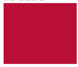
Dark Red WXR0083 SR .43 TE .86 SRI 48 SR .32 TE .86 SRI 33