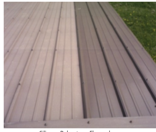
Silicone Polyester Fluropolymer